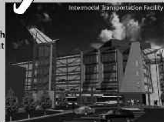
Intermodal Transportation Facility

will add 752 additional parking spaces to the downtown, as well as centralize public transportation. The project is expected to be completed in the summer of 2009. Next, the $14 million COAL STREET PARK RENOVATION PROJECT (pictured below) will completely rehabilitate the 31 acre park into a multi-use public sports complex where teams, leagues and individuals can compete, learn skills and enjoy new recreational opportunities.