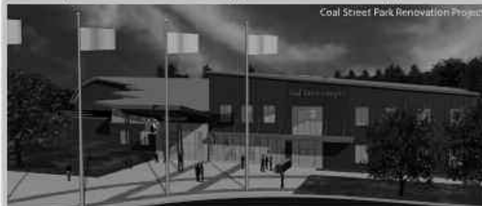
Coal Street Park Renovation Project