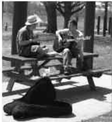
Aspiring musicians relax in Kirby Park

Happy New Year from the City of Wilkes-Barre!