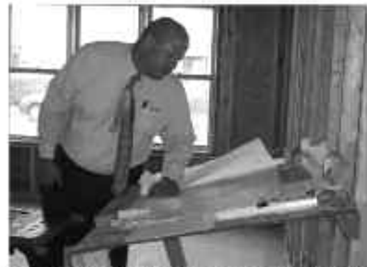
Mayor Leighton reviews plans for new city housing