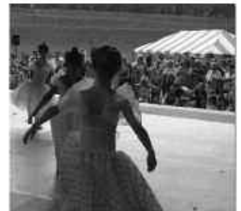
Cherry Blossom Festival - Pirouettes in the Park