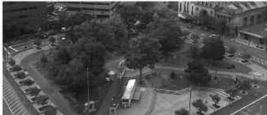
Wilkes-Barre's Public Square