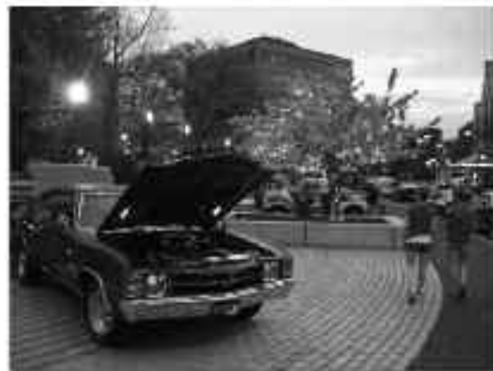
Monthly car show on Public Square