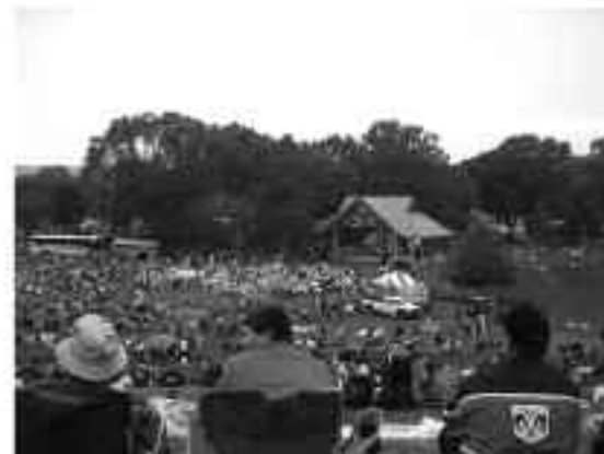
Old Fashioned 4th of July Celebration