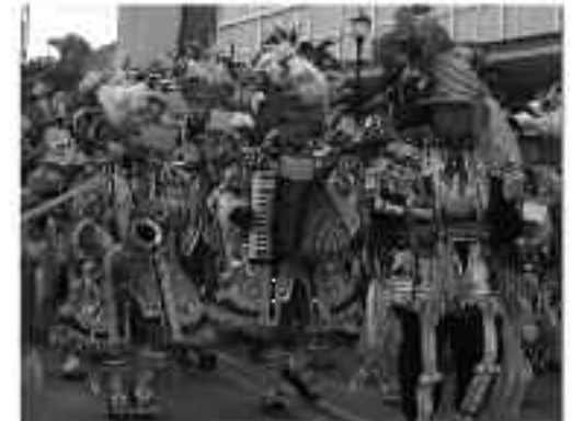
South Main Street during the St. Pat's Parade